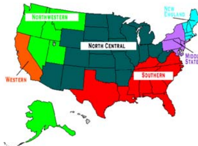
Figure 1: The Six Accrediting Regions

Regional Accrediting Agencies. Seven regional accrediting agencies operate in the six U.S. regions. (See Figure 1.) Regional accrediting agencies accredit institutions including all programs and sites of each institution.