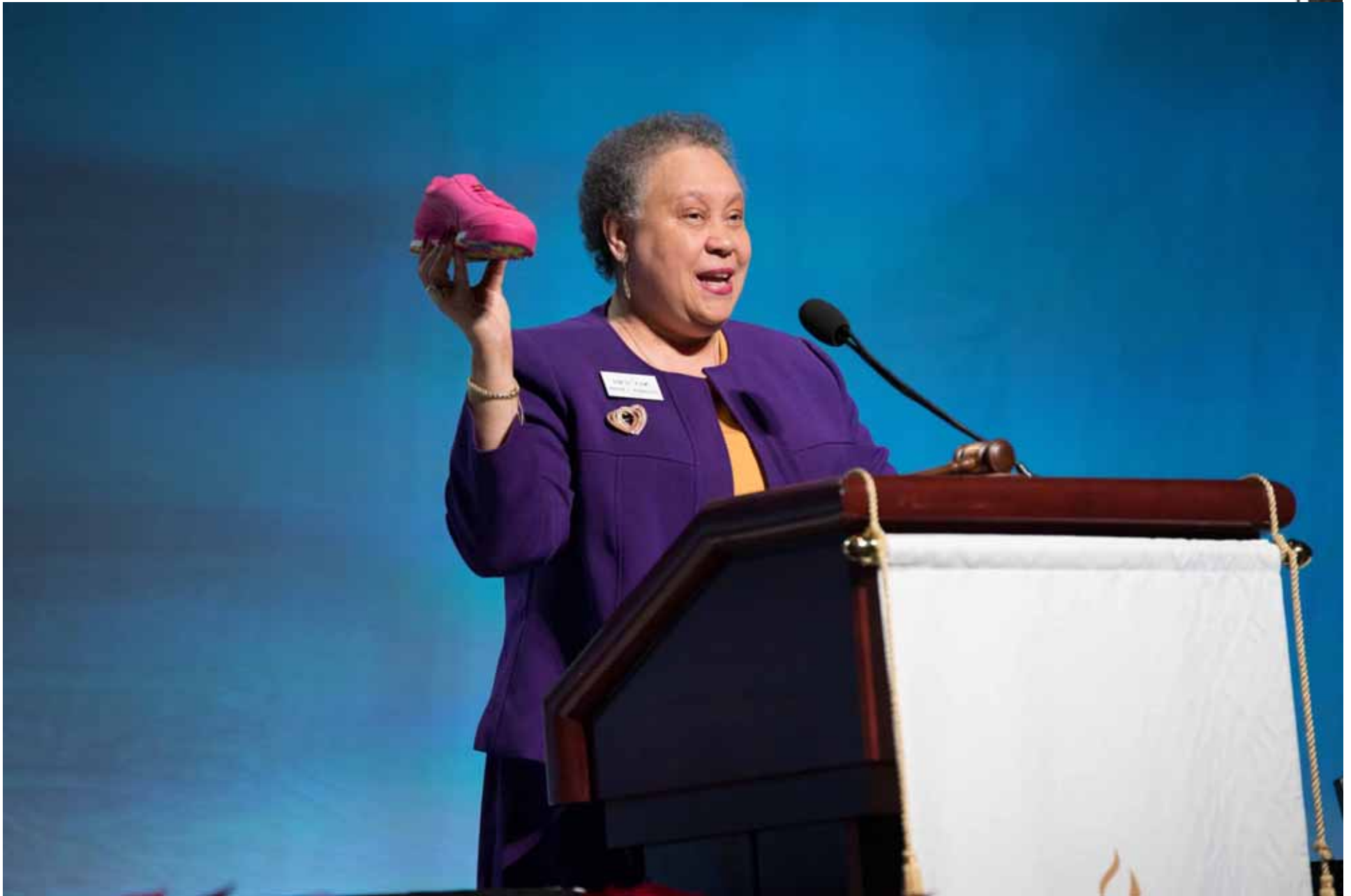
Dr. Wheelan recommended comfortable shoes because the Music City Center was located on 16 acres with over 1 million square feet of space .