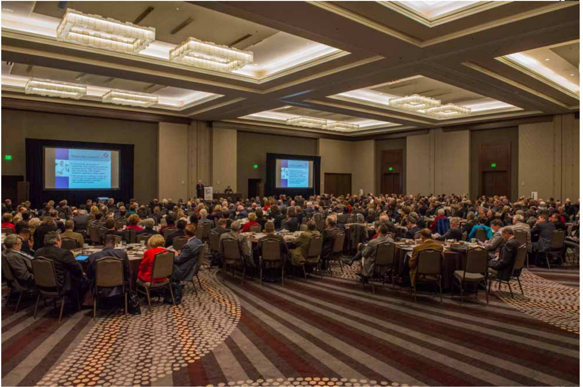
About 400 CEOs attended Presidents' Day activities at the Omni Nashville hotel.