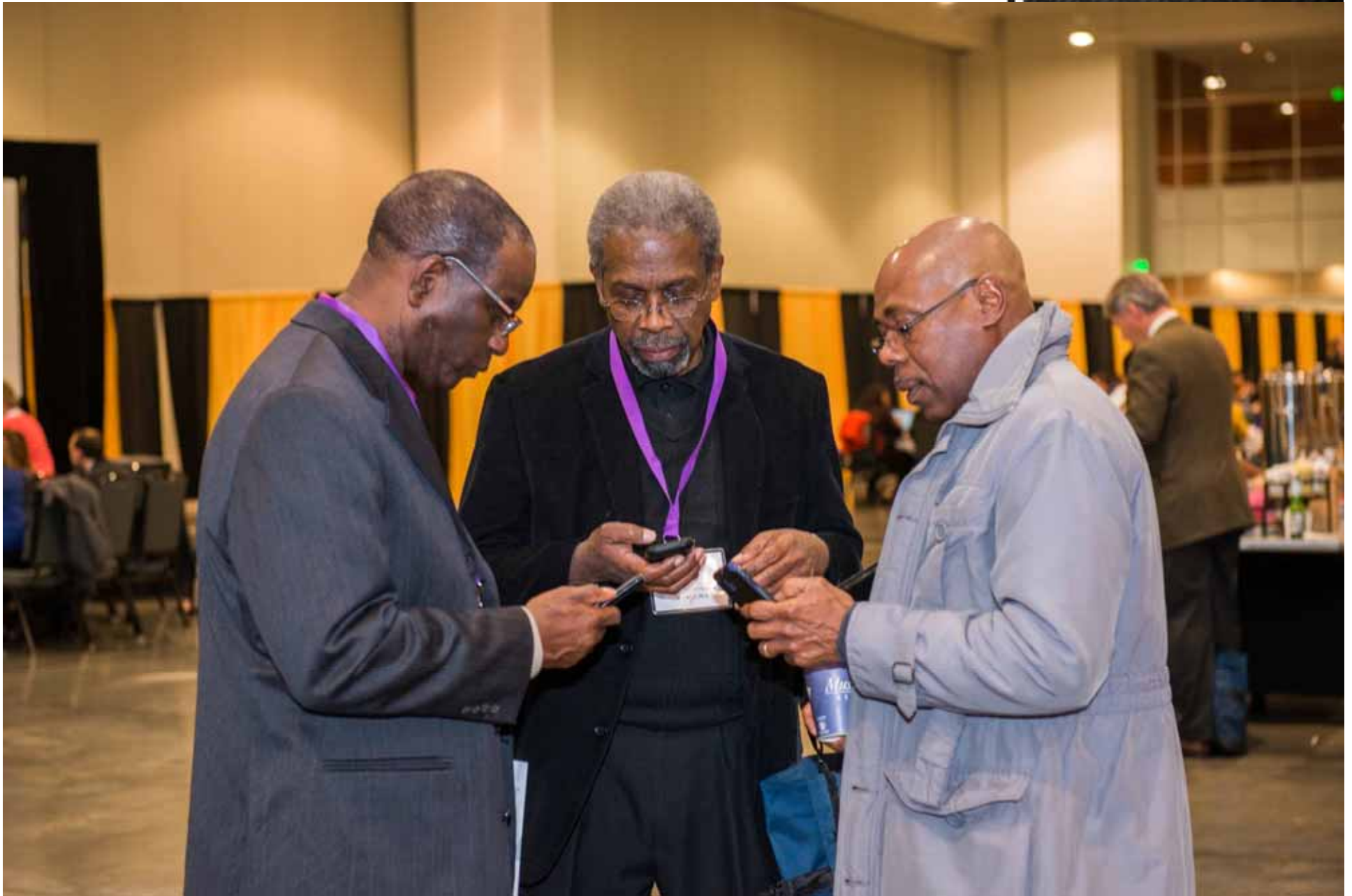
A sign of the times . . .