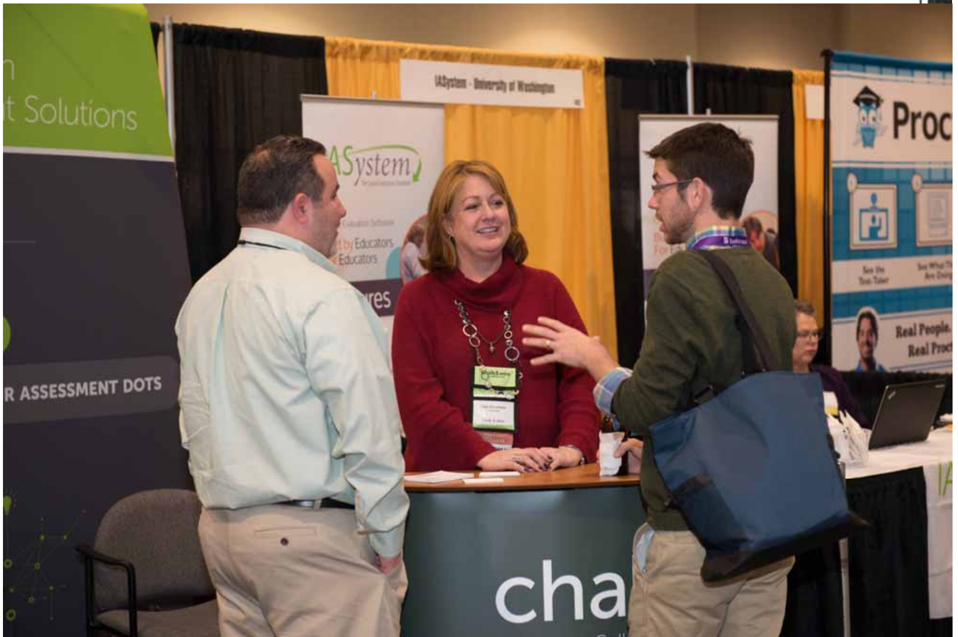
Some exhibitors have been regular participants in the SACSCOC expo.