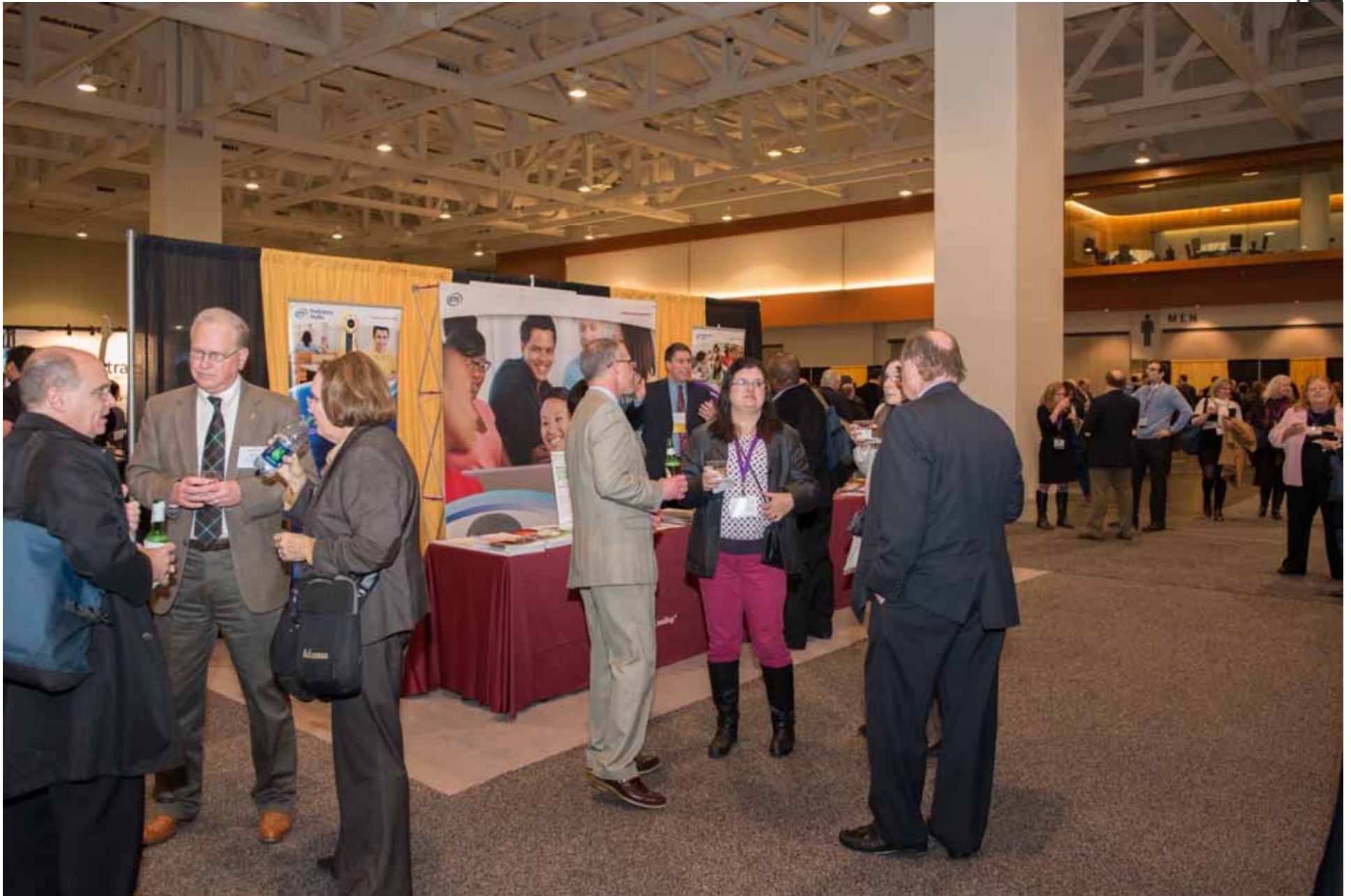
Attendees seemed to enjoy their time in the expo hall.