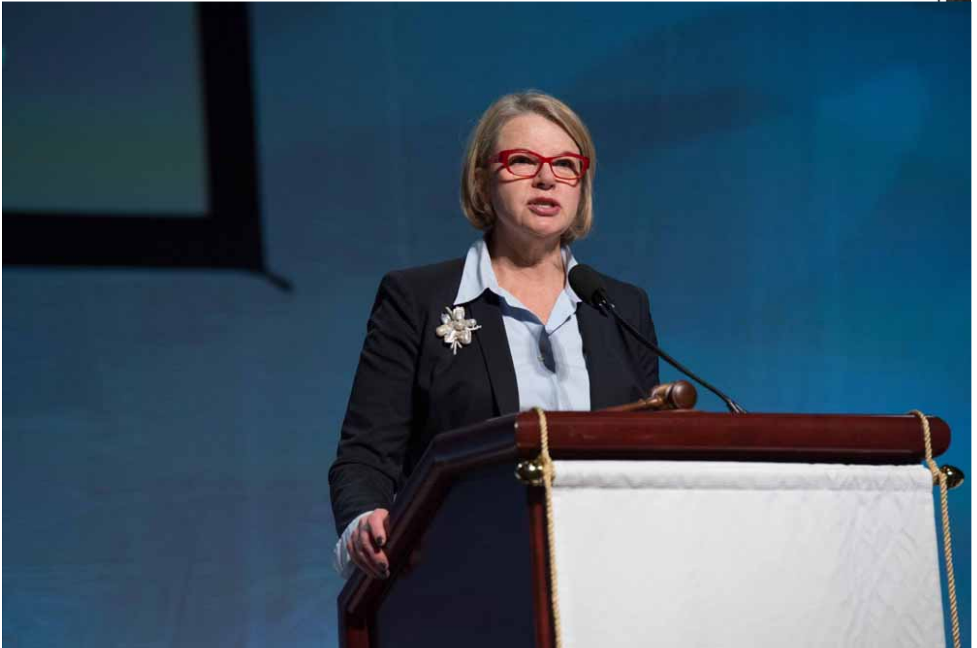
The former Secretary of Education cited several problems and potential solutions for higher education.