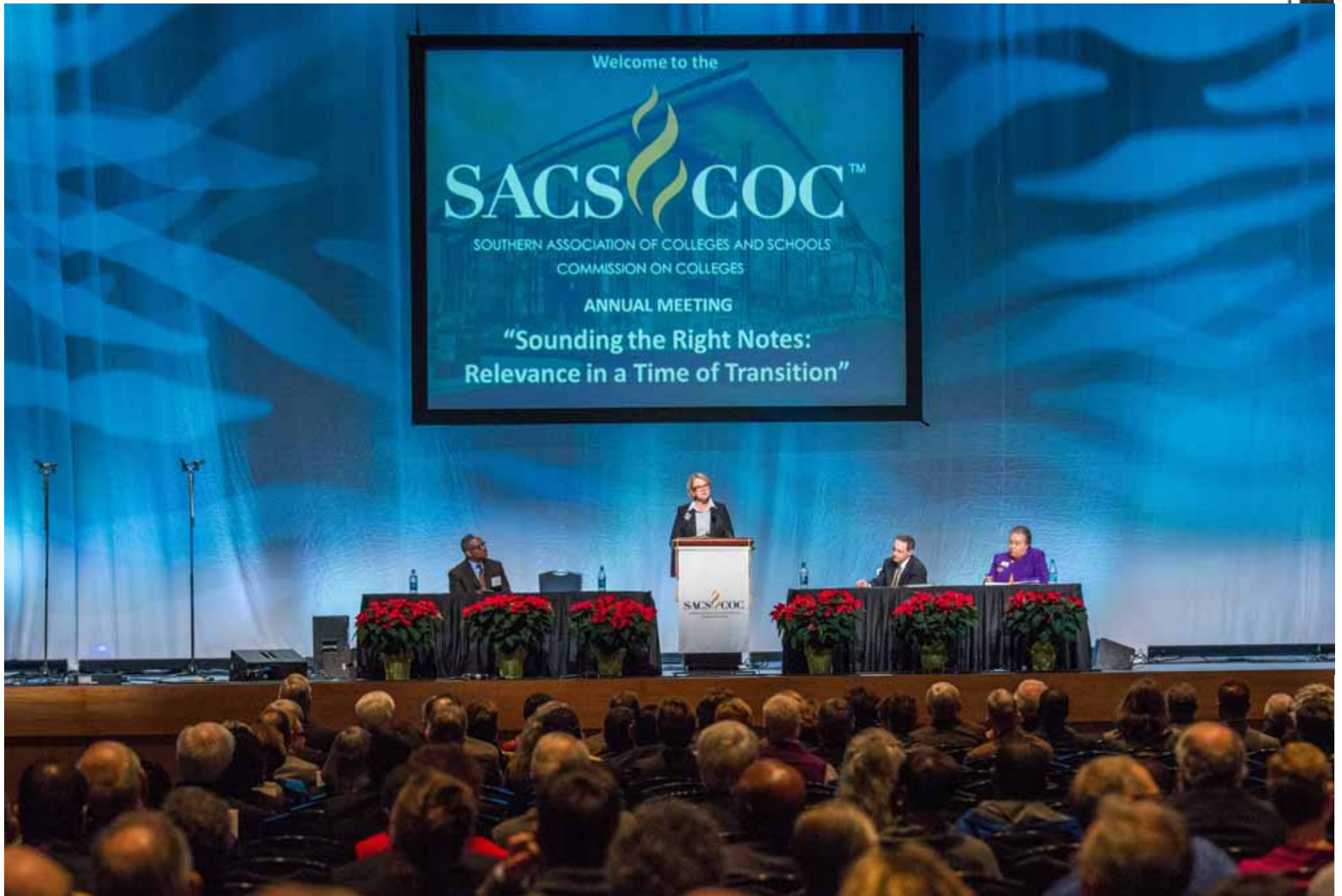
The Honorable Margaret Spellings spoke on “Higher Education at a Crossroads: Responding and Adapting to Demands for Change.”