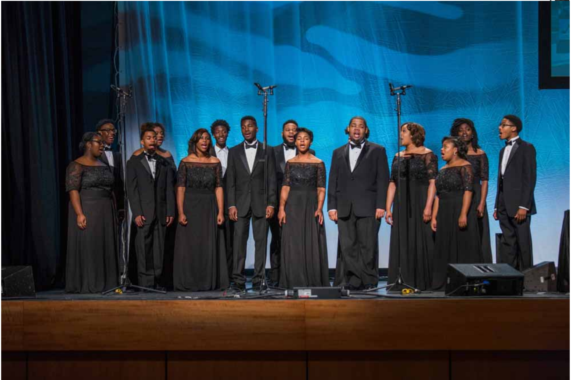
Melodious acapella music was provided at the opening session by the renown Fisk Jubilee Singers® from Fisk University in Nashville, TN.