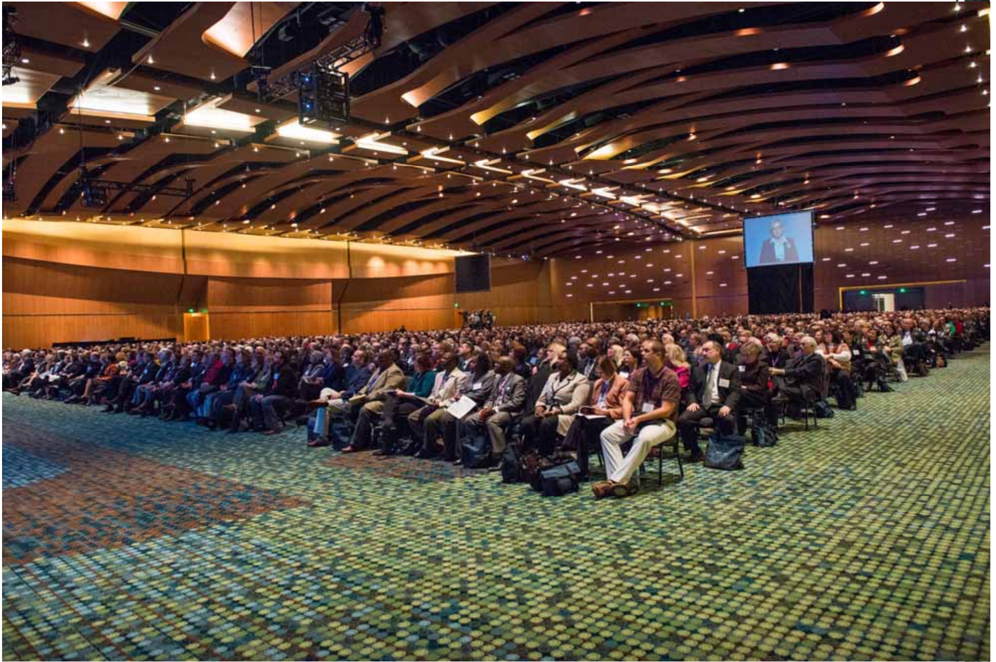
Almost 4,500 individuals attended the opening session in the Grand Ballroom at the Music City Center in downtown Nashville.