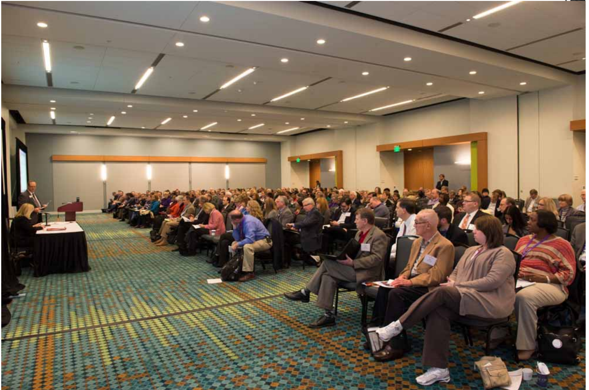
All SACSCOC staff sessions were quite large.